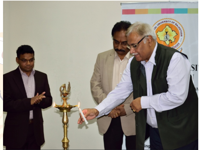
Training Program on MOOCs (12 -14 March 2018)

Teaching Learning Centre (TLC@CURaj) at Central University of Rajasthan was established in the year 2017-18 with a vision of support evidence based teaching and provides diverse opportunities for teachers. It is funded by MHRD, Govt. of India under the Scheme of Pandit Madan Mohan Malaviya National Mission on Teachers and Teaching (PMMNMTT). It is envisaged to help teachers to modernize their teaching style, to scaffold concepts and information in a way that students can meaningfully take in, and to help students learn more deeply and retain what they have learnt. It is also meant to train teachers about the new and effective methods of teaching and TLC will promote on a continuous basis, discipline-specific curricula, pedagogy, learning materials (including e-content) for use by the teachers in colleges and postgraduate departments.