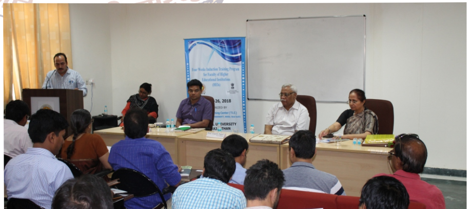
Four Weeks Induction Training Program (1 - 26 May 2018)

Eminent speakers from reputed national institutions will deliver the lectures.