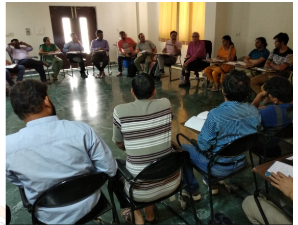
Induction Training Program (1 - 26 May 2018)