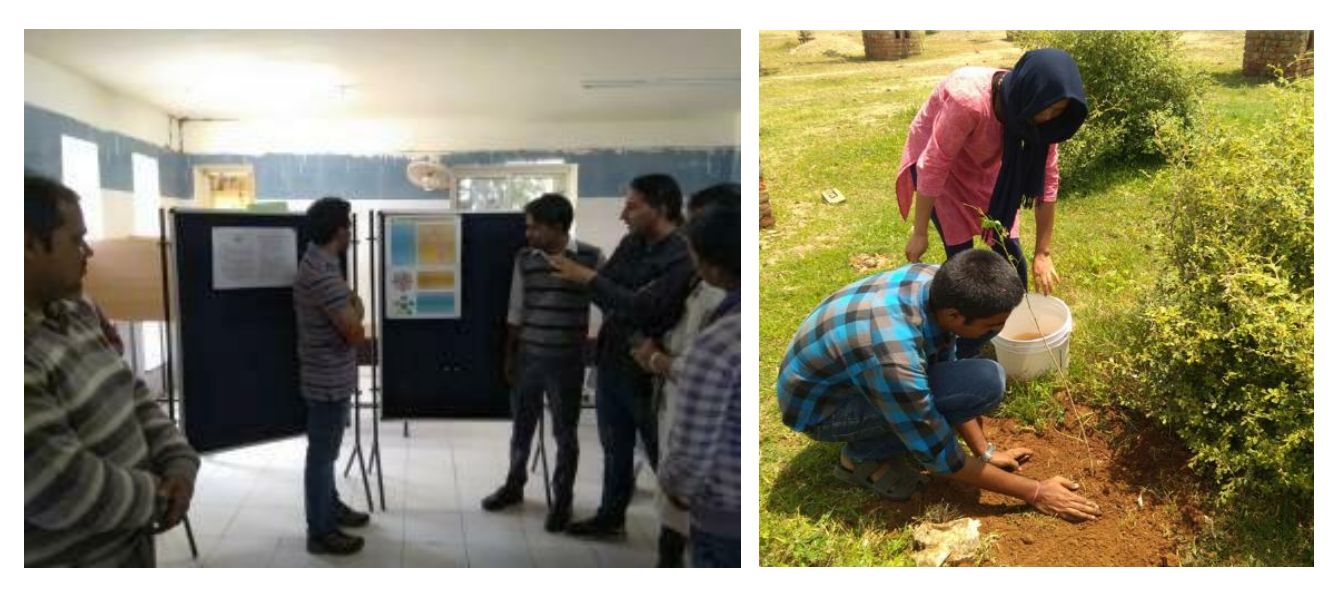
Poster presentation and plantation activity as part of theory and practicum in social work