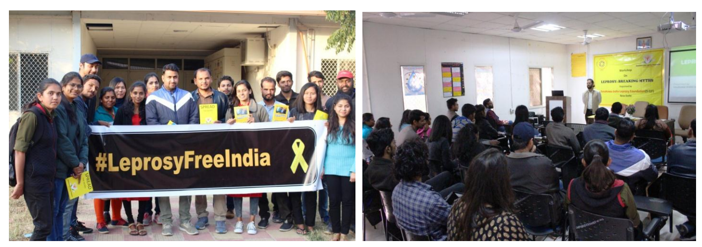
Awareness and sensitization programme on "Leprosy: Breaking the Myths" held on 11<sup>th</sup> January 2019