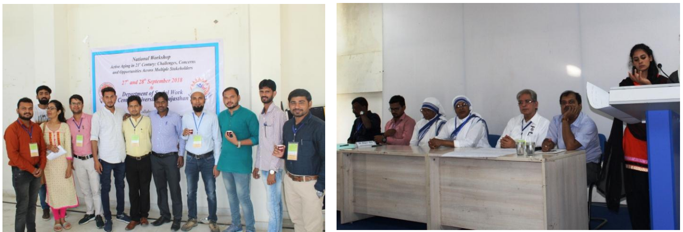
National Workshop on "Active Ageing in 21<sup>st</sup> Century: Challenges and Opportunities among Multiple Stakeholders", held on 27<sup>th</sup> and 28<sup>th</sup> October 2008