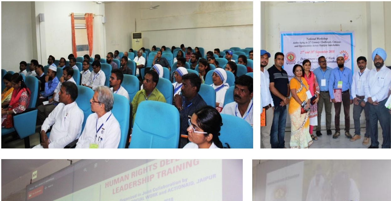
Conducting Conferences and seminars on timely relevant theme is one of the salient features of the Department of Social Work