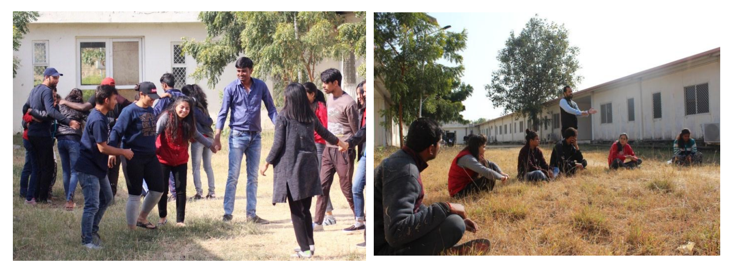
Skill Lab on Programme Media held on 12<sup>th</sup> January 2019