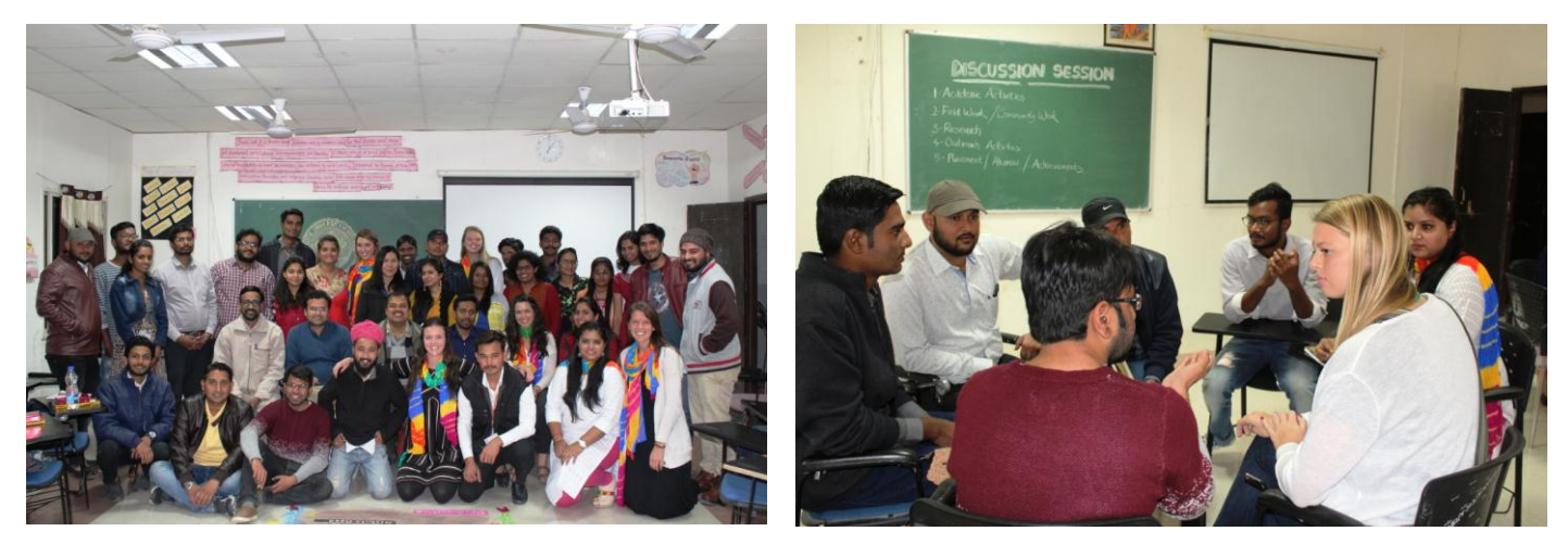
International Colloquium in collaboration with St Ambrose University, USA, on 11<sup>th</sup> and 12<sup>th</sup> January 2018