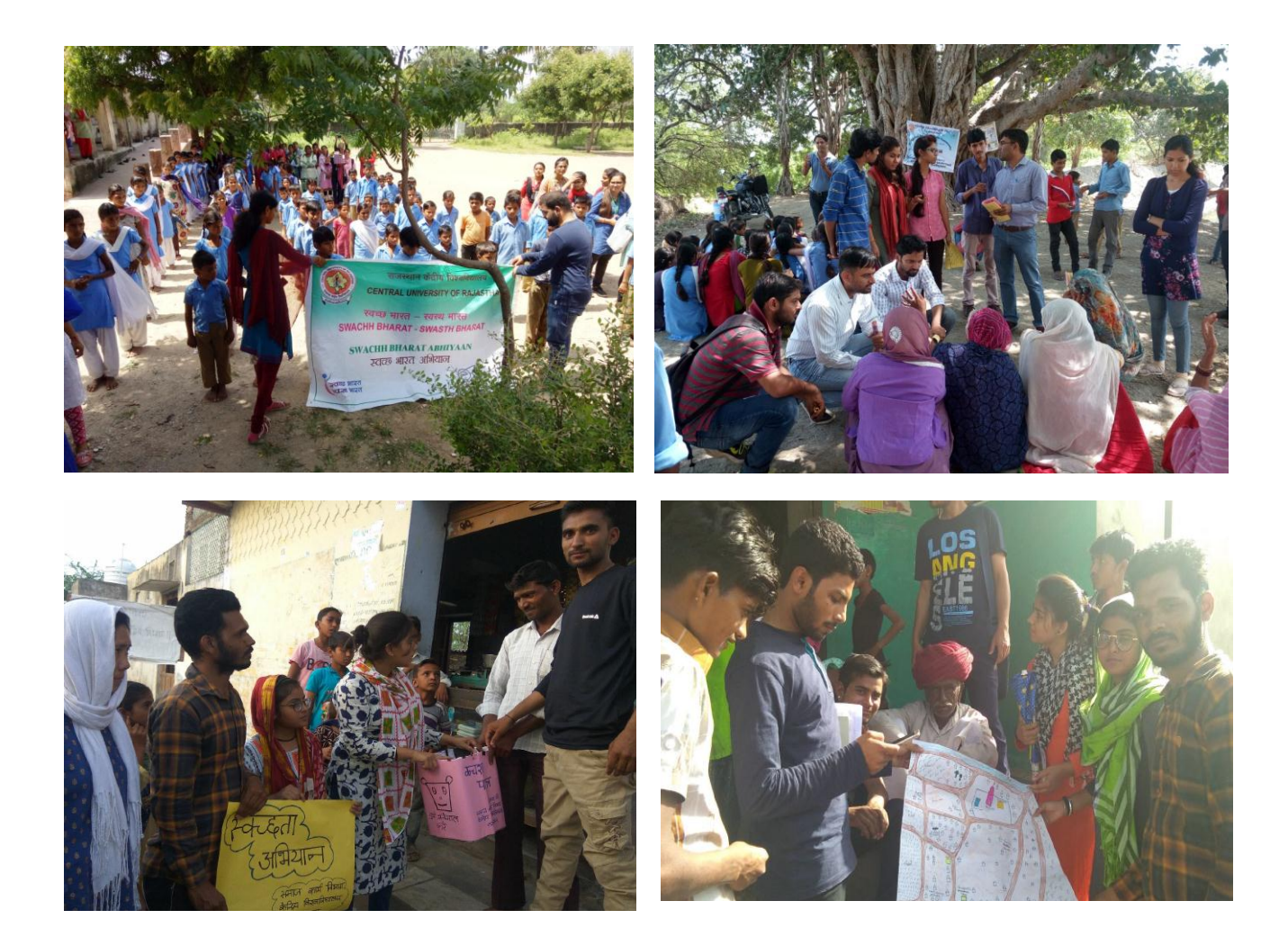
Fieldwork activities by the students of Social Work