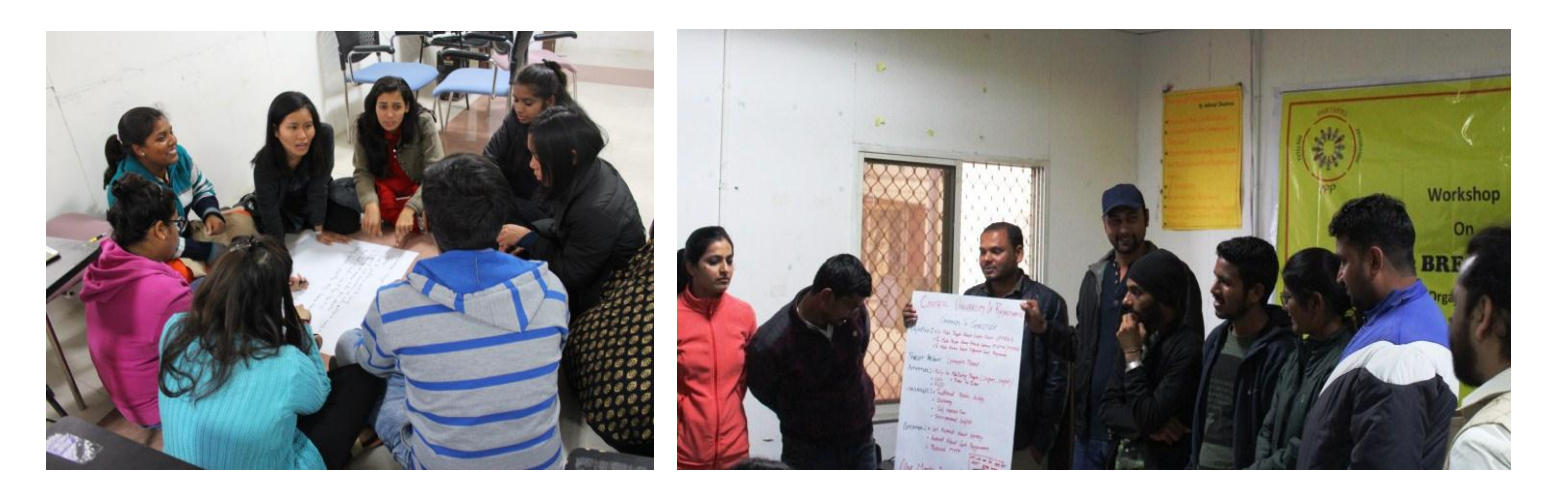
Group exercise as part of class-room learning