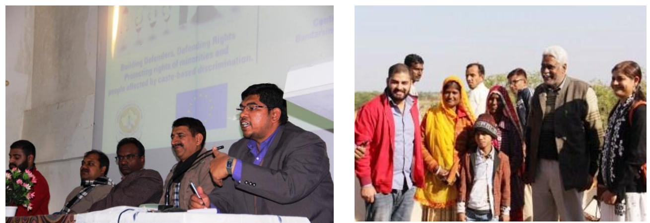
Human Rights Defender's Training in Collaboration with Action Aid Organized on 12<sup>th</sup>-14<sup>th</sup> December 2018