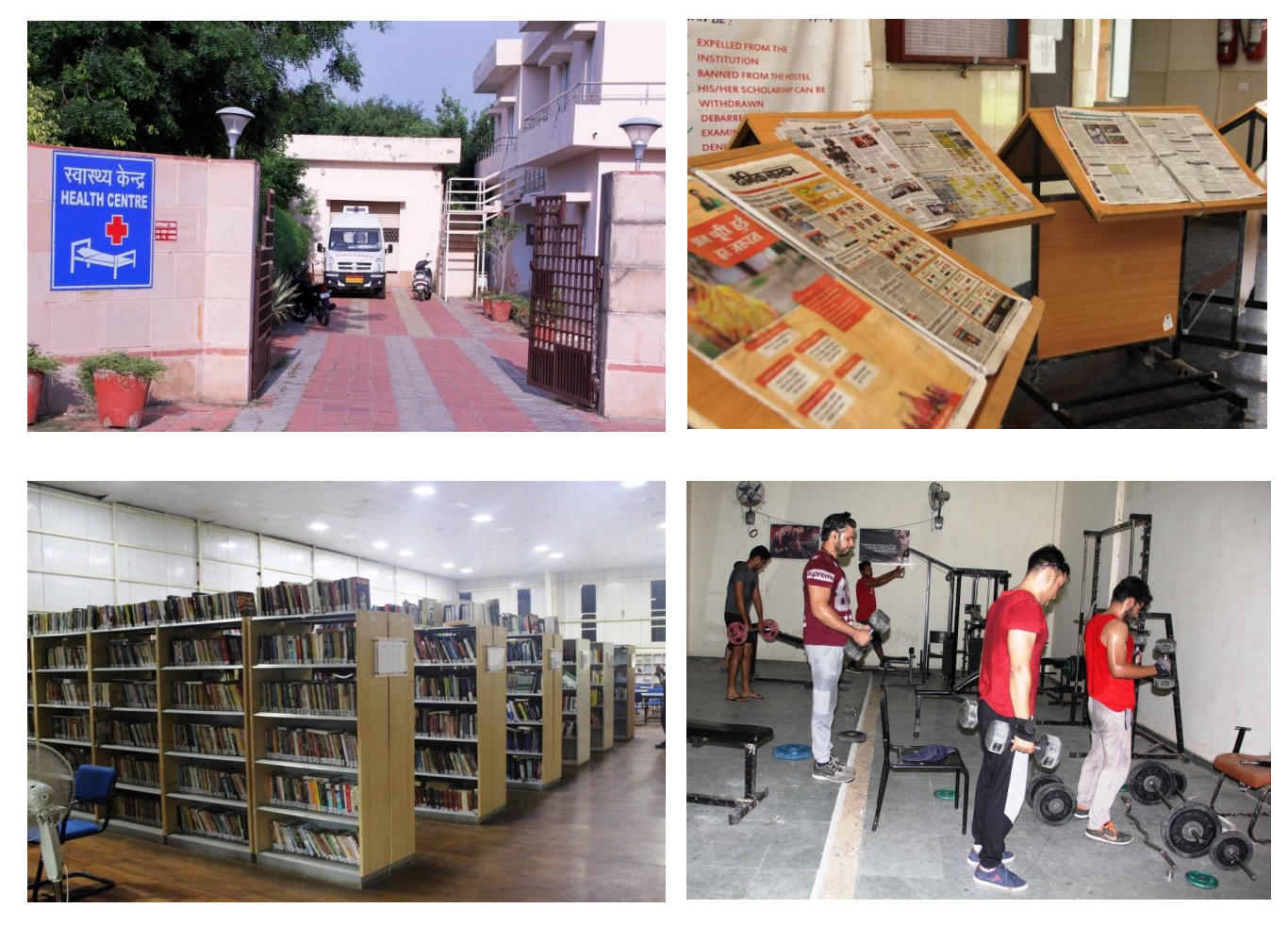
Facilities in the campus and Hostels

The University provides transport facility to the students from the Campus till Bandar Sindri Chowk and back on all weekdays. On Sundays, the University Bus provides transportation from the Campus till Kishangarh and back. The University has health centre equipped with Medical Officer and nurse who are available throughout the day in the campus for any health related problems of the students. There are facilities of sports and cultural activities, hi-speed internet connectivity in the hostel and campus for the students.