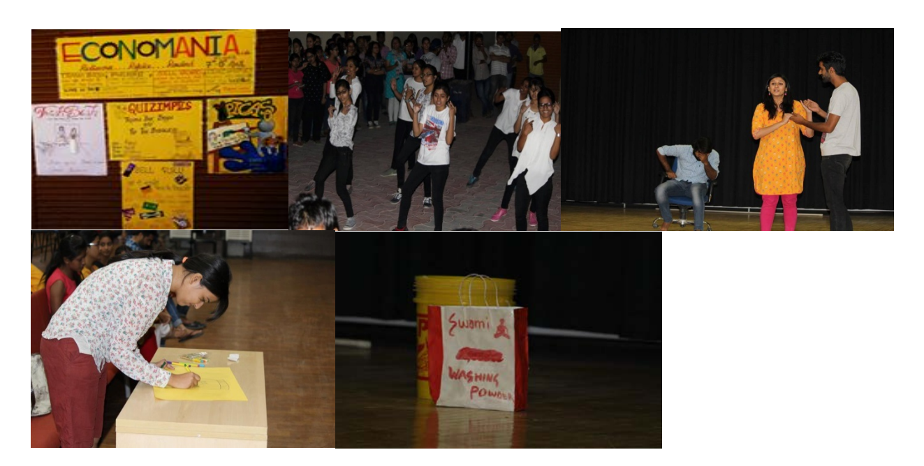
Sell Guru, Quizmpics, Picaso, Trash Bash and Panel Discussion were organized. 500 students' registration was received for the same from various departments of the university.

Department of Economics has organized the event Economania 2016 under the banner of Economic society on April 7^{th} and 8^{th} 2016.