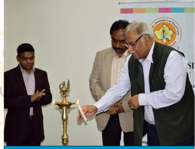
Training Program on MOOCs (12 -14 March 2018)

Teaching Learning Centre (TLC@CURaj) at Central University of Rajasthan was established in the year 2017-18 with a vision of support evidence based teaching and provides diverse opportunities for teachers. It is funded by MHRD, Govt. of India under the Scheme of Pandit Madan Mohan Malaviya National Mission on Teachers and Teaching (PMMMNMTT). It is envisaged to help teachers to modernize their teaching style, to scaffold concepts and information in a way that students can meaningfully take in, and to help students learn more deeply and retain what they have learnt. It is also meant to train teachers about the new and effective methods of teaching and TLC will promote on a continuous basis, discipline-specific curricula, pedagogy, learning materials (including e-content) for use by the teachers in colleges and postgraduate departments.