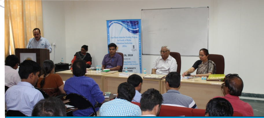
Four Weeks Induction Training Program (1 - 26 May 2018)

Eminent speakers from reputed national institutions will deliver the lectures.